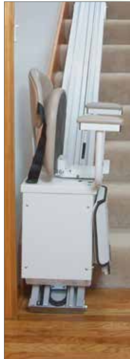
14" width when folded