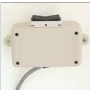
Wall mounted call/send controls