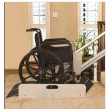
Incline Platform Lifts