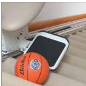
Safety sensors on footrest