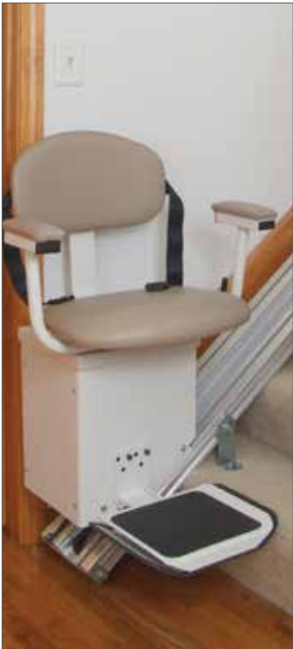
Summit indoor or outdoor