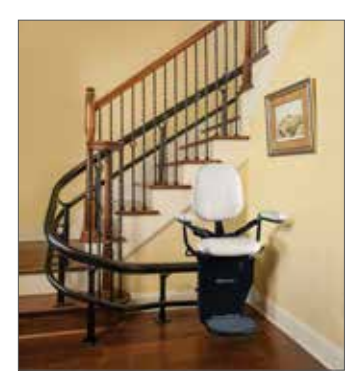
Curved and Straight Stair Lifts