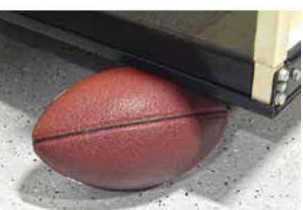
Safety pan shuts down the lift when obstructions are under unit.