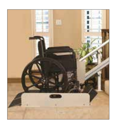
Incline Platform Lifts