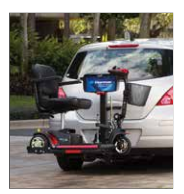
Multiple auto lift solutions for chair or scooter