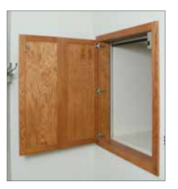
Dumbwaiters and Cargo Lifts